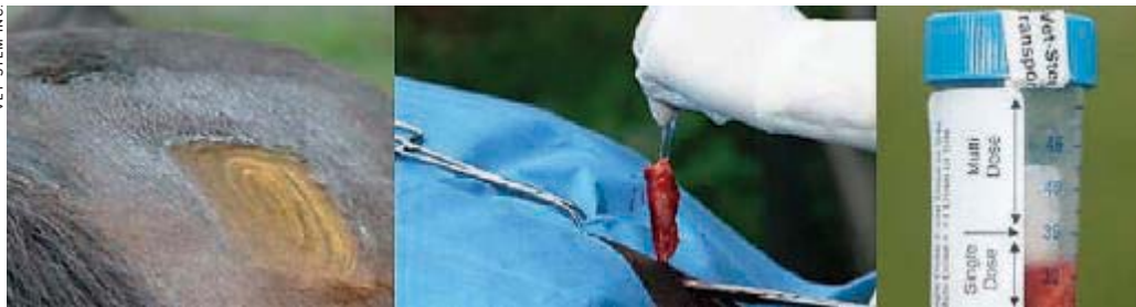
The process of acquiring adipose-derived stem cells: The harvesting site is prepared (left), then about two tablespoons of fat are removed (center). Finally the stem cells are prepared (right) and reinjected into the horse.

support the use of these treatments and suggest that they have the potential to improve the healing process.